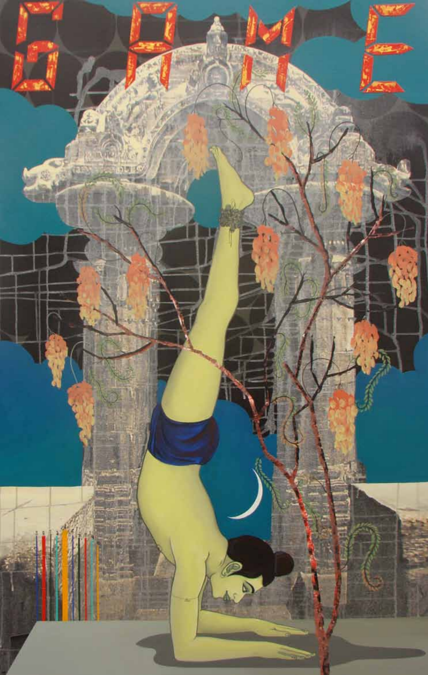
Boy Dancer | Acrylic on Canvas | 42 x 66 inches | 2008