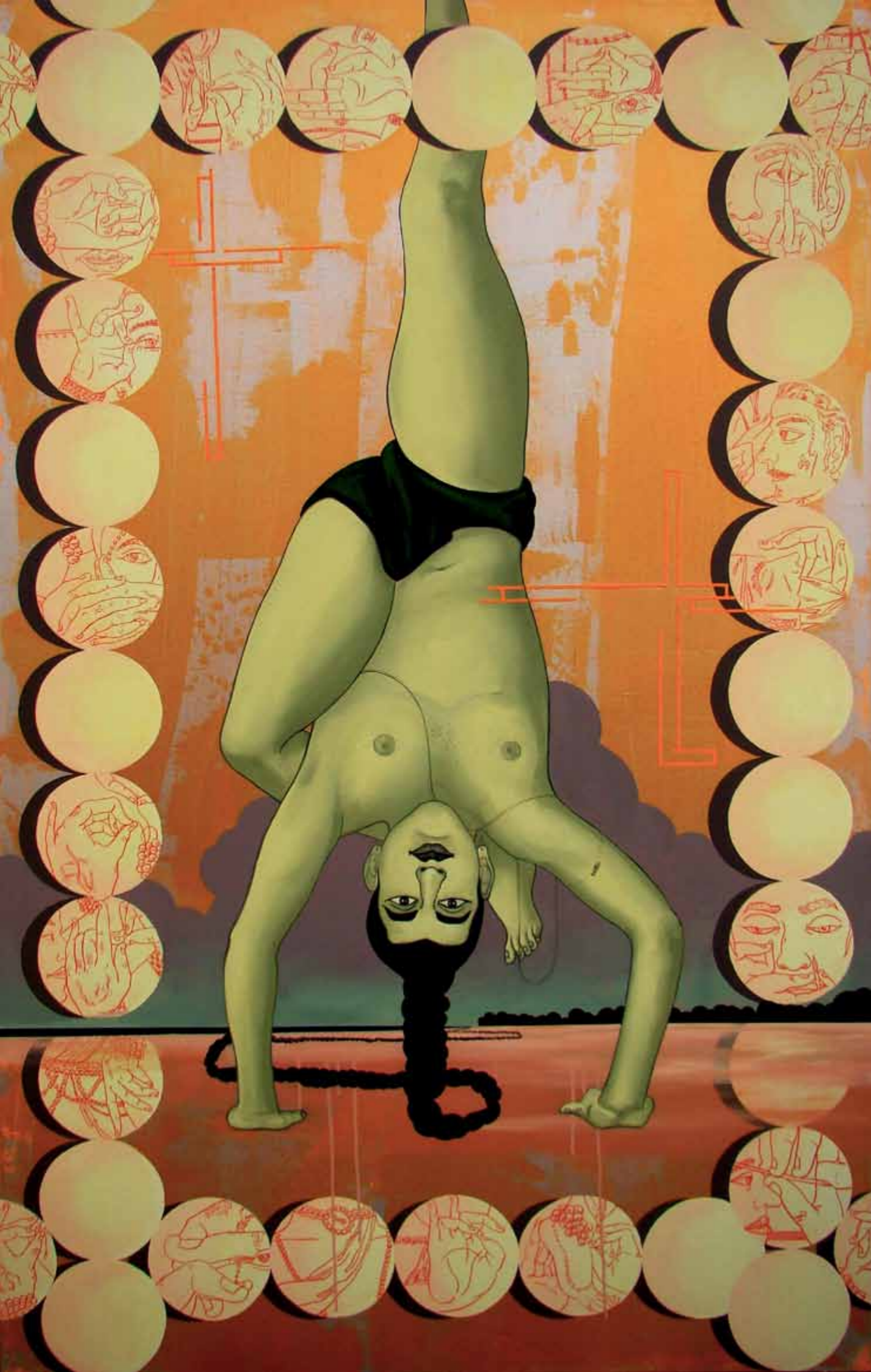
Boy Dancer | Acrylic on Canvas | 42 x 66 inches | 2008