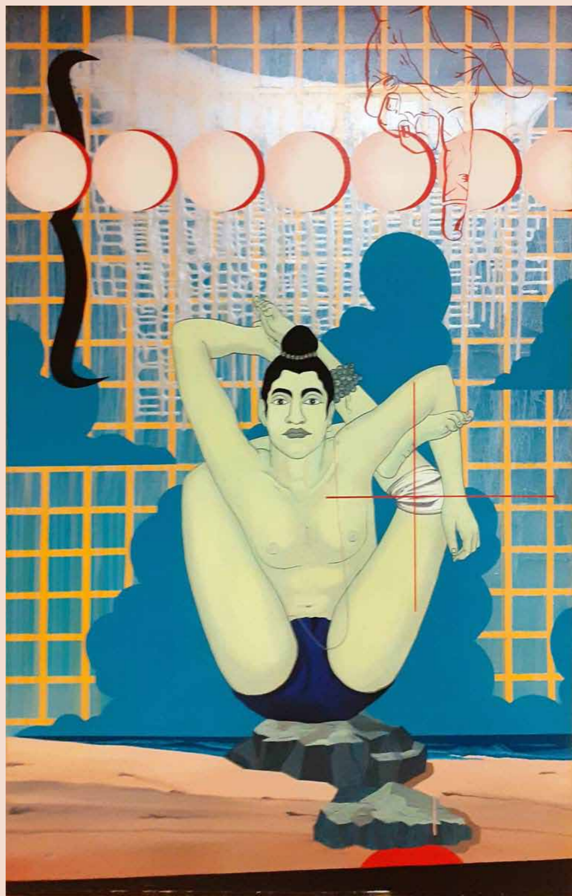
Boy Dancer | Acrylic on Canvas | 42 x 66 inches