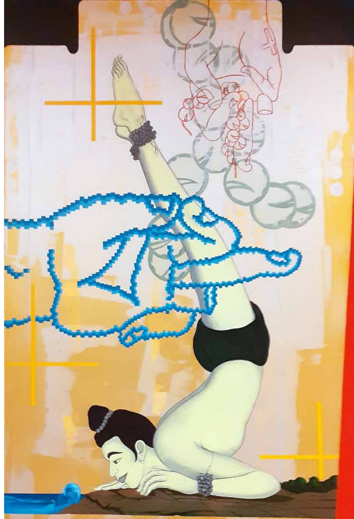
Boy Dancer Acrylic on Canvas 42 x 66 inches