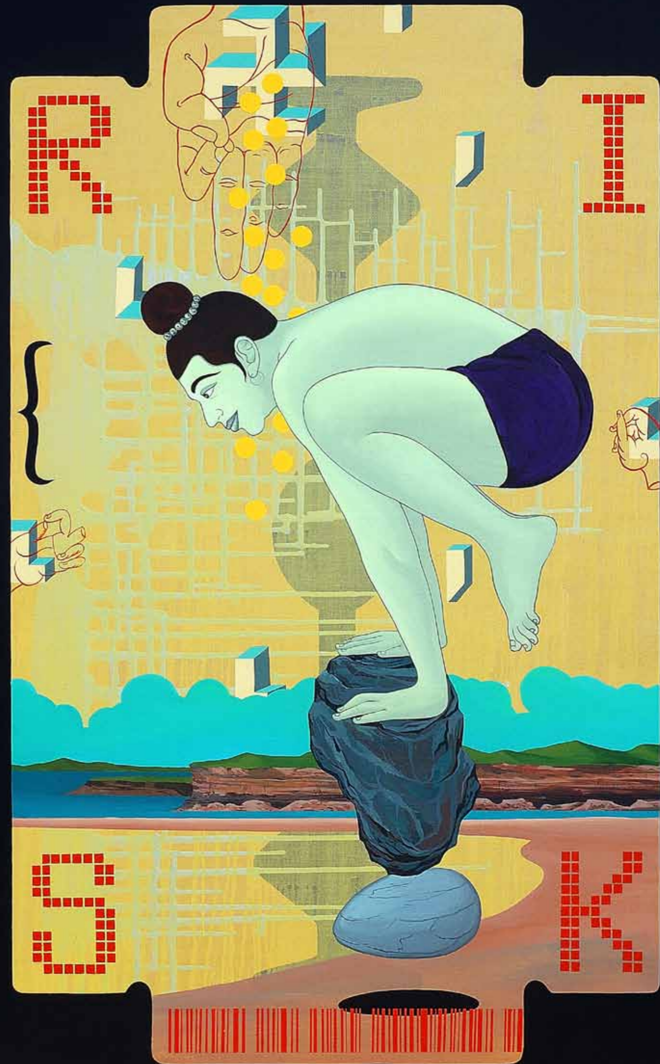
Boy Dancer Acrylic on Canvas 42 x 66 inches