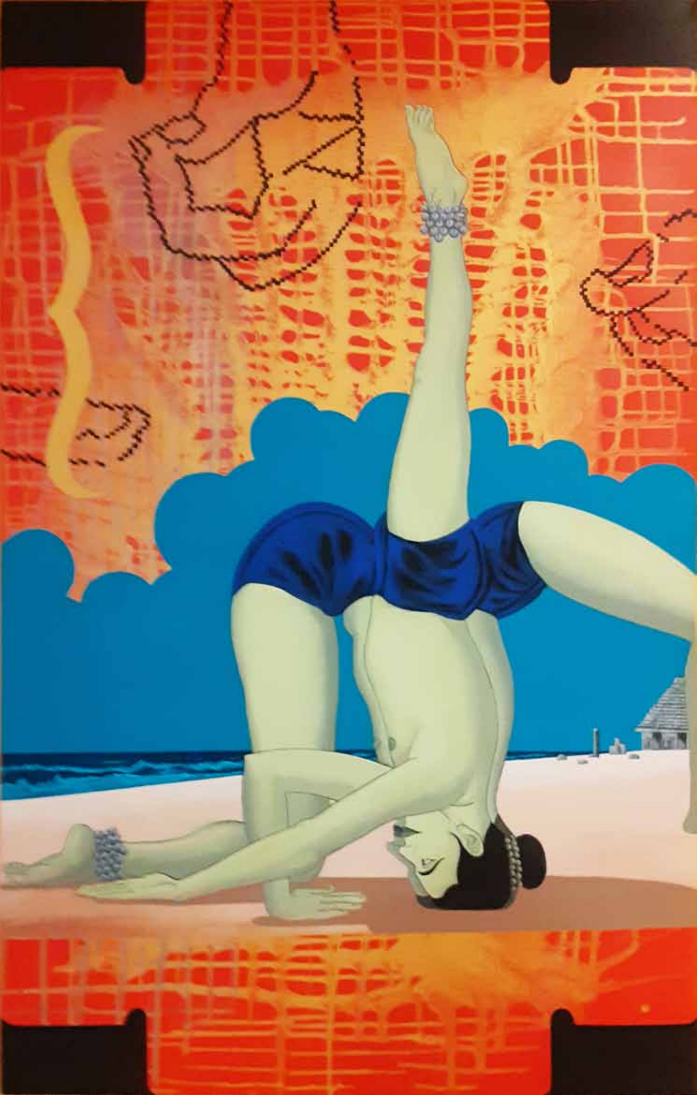
Boy Dancer Acrylic on Canvas 42 x 66 inches